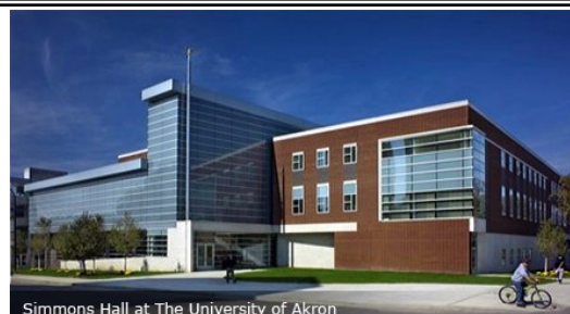
Simmons Hall at The University of Akron

Fall & Spring Office Hours: Monday - Friday 8 a.m.-5 p.m.